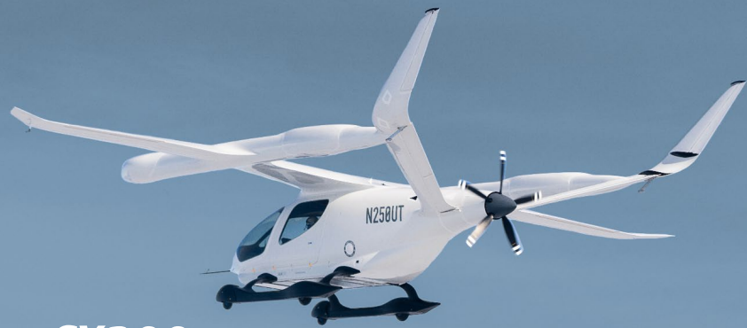
CX300 electric fixed-wing

Safe | Built-in redundancies and extensive real-world testing